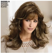
Gayle Wig by Paula Young®