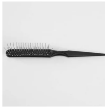
Wig Brushes for Short Wigs