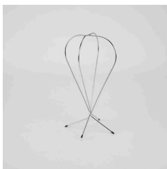
Wig Drying Stand #A1056