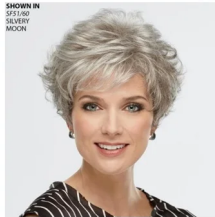
Celebrity WhisperLite® Wig by Paula Young®