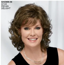
Long Color Me Beautiful WhisperLite® Wig by Paul...