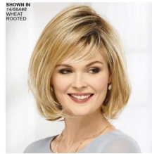
Shannon VersaFiber® Wig by Paula Young®