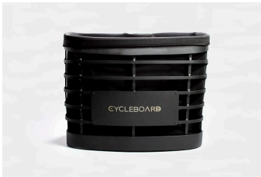
MATTE BLACK CARGO BASKET $279.00