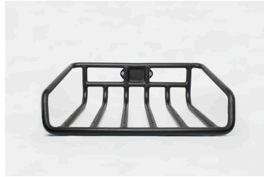
Matte Black Front Cargo Rack $89.00