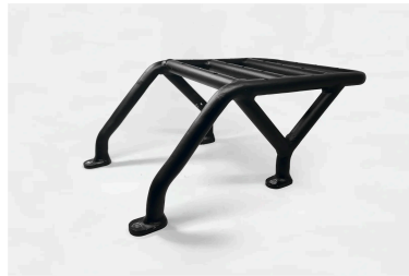
Matte Black Rear Cargo Rack $125.00