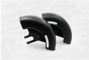
Front Fender Kit $89.00