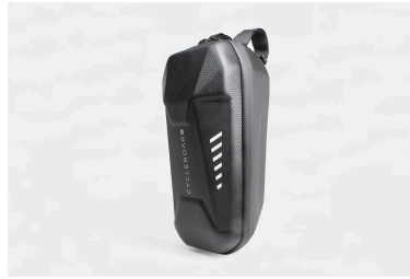
Storage Bag 3L $49.00