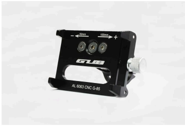
Cell Phone Mount $19.00